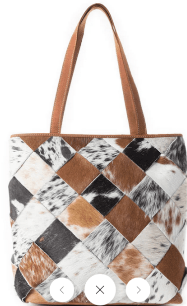
CONCEAL CARRY WEAVE HIDE BAG CC-8073