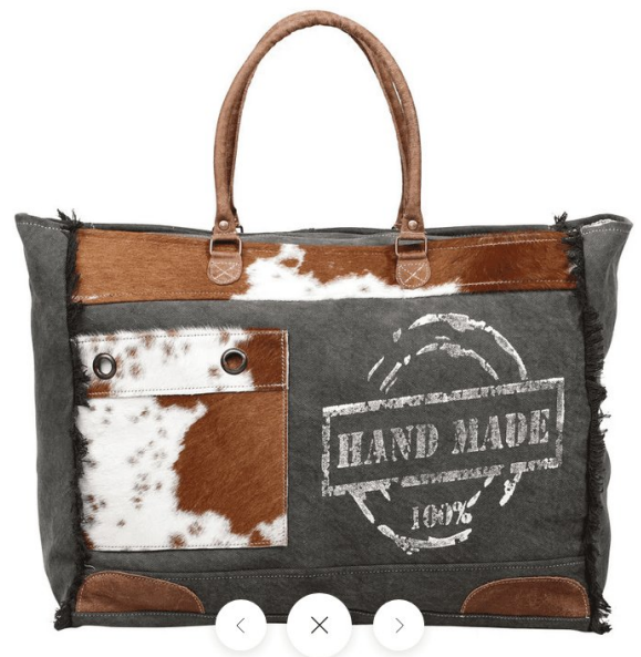
HIDE WEEKENDER TOTE HWT-1201