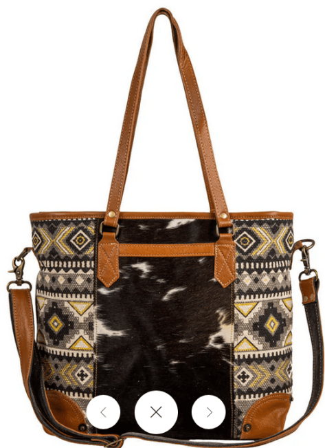
HAIR-ON-HIDE TOTE BAG TB-6751