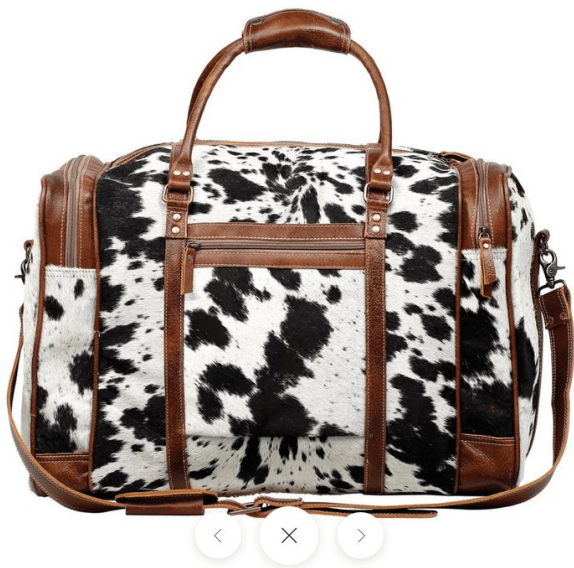
HIDE WEEKENDER DUFFLE BAG SKU# 1124