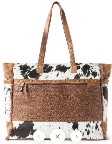
HIDE WEEKENDER BAG HP10917