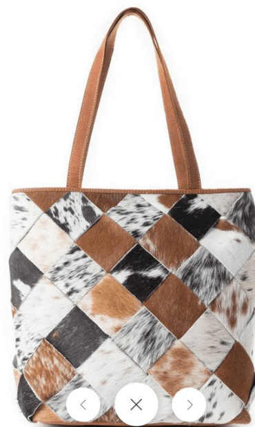
CONCEAL CARRY WEAVE HIDE BAG CC-8073