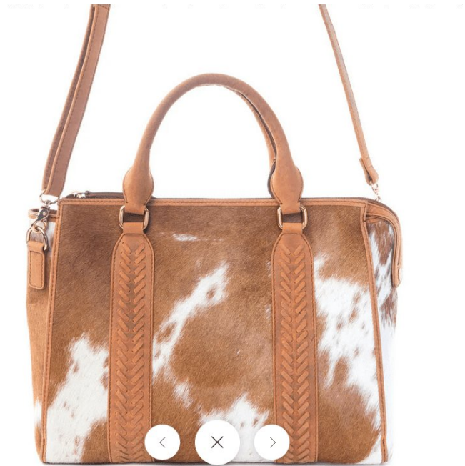
IVORY HAIR-ON-HIDE CONCEAL CARRY CC-13701