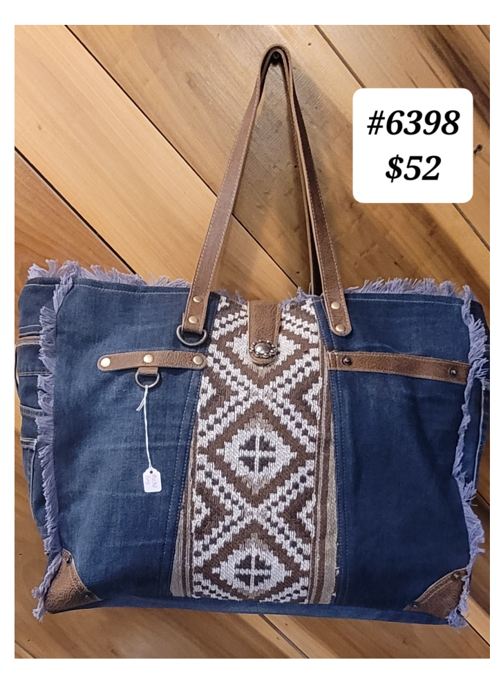
CANVAS & JEAN BAG - CJB6398