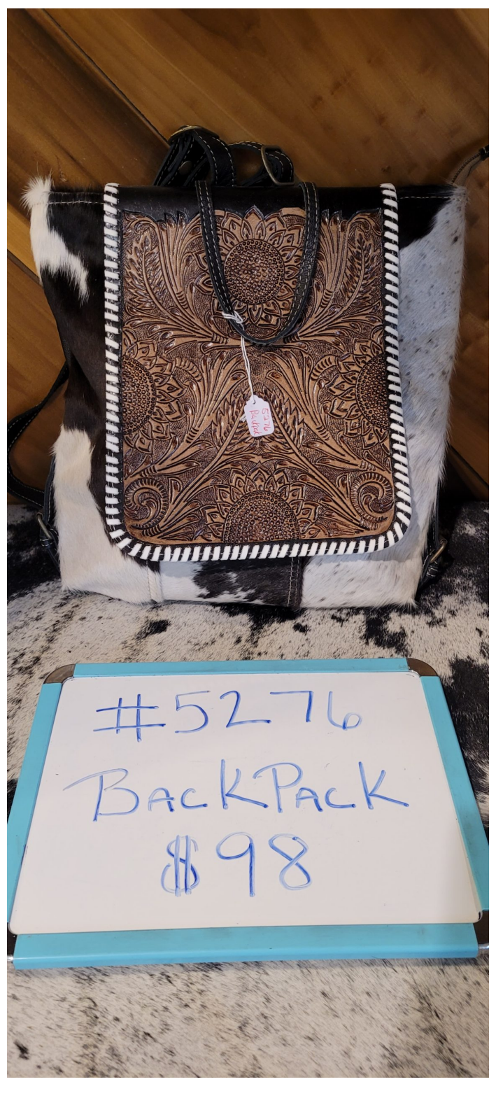
HAIR-ON & LEATHER BACKPACK HLBP5276