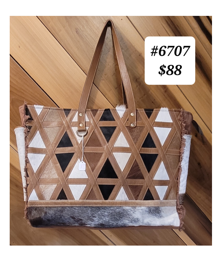
HAIR-ON & CANVAS BAG - HP6707